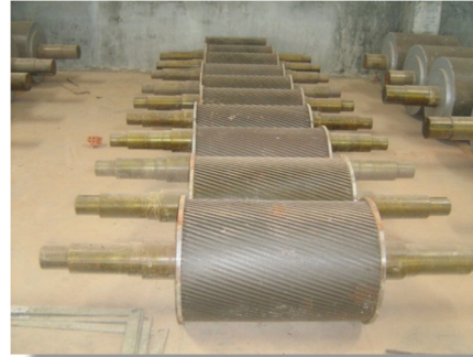
SHREDDER / CUTTER ROLL