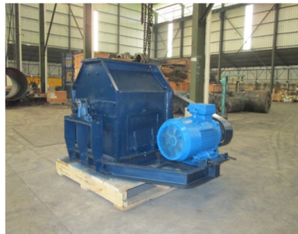
RIPPLE MILL UNIT