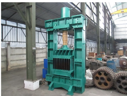
HYDRAULIC CUTTING BALL PRESS