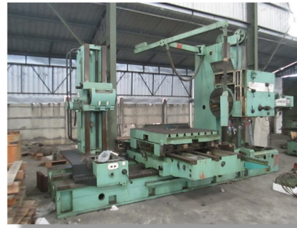
HORIZONTAL BORING MACHINE