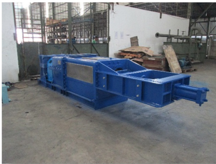
SCREW PRESS UNIT