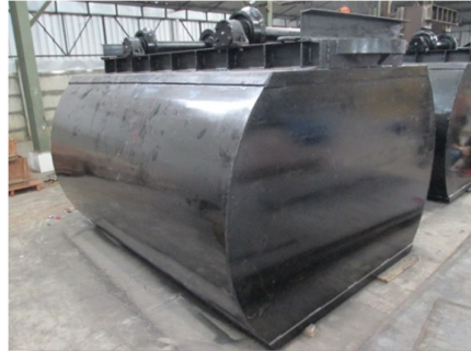
LORRY / FRUIT CAGES UNIT