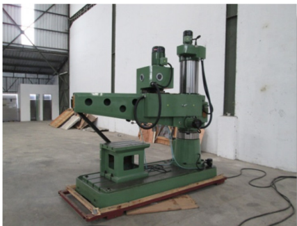
RADIAL DRILLING MACHINE