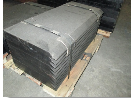
FIXED KNIFE SHREDDER