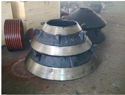
MANTLE CONE / BOWL LINER