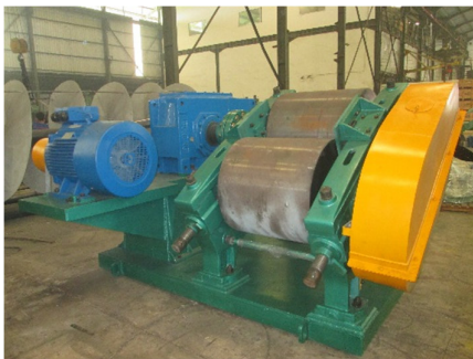
CREEPER / MANGLE MACHINE